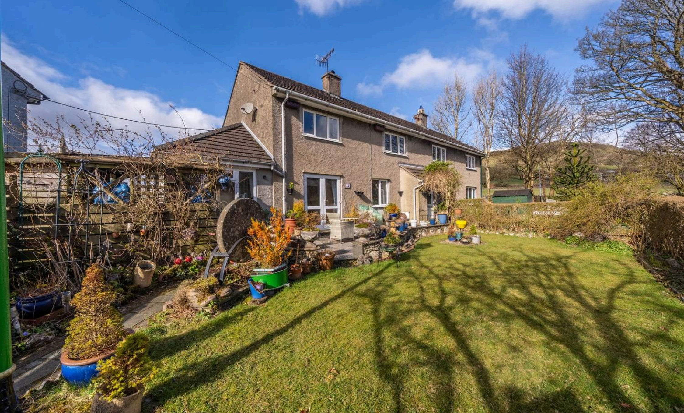
22 Beck Nook, Staveley £285,000