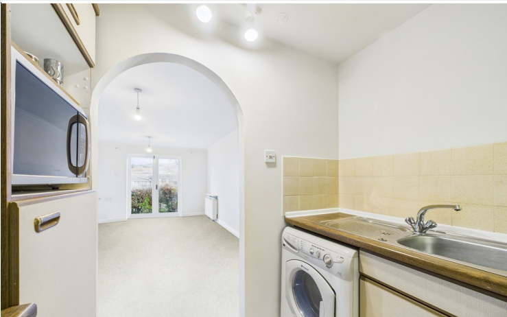
Kitchen and Living Room

This welcoming two bedroom ground floor apartment offers all that you need for comfortable living in the heart of The Lake District National Park.