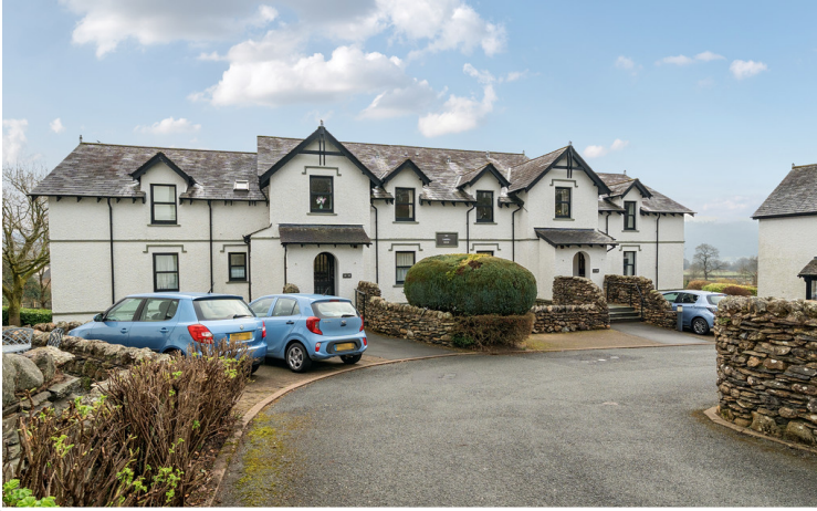
13 Campbell House