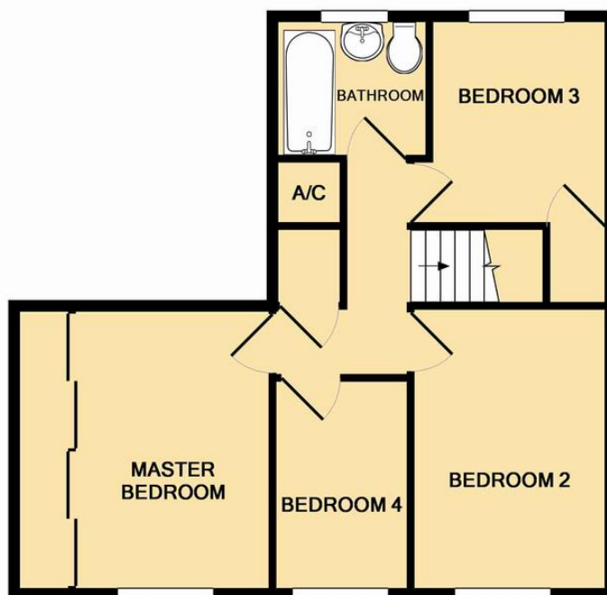
1ST FLOOR APPROX. FLOOR AREA 44.1 SQ.M. (475 SQ.FT.)

TOTAL APPROX. FLOOR AREA 80.6 SQ.M. (868 SQ.FT.)