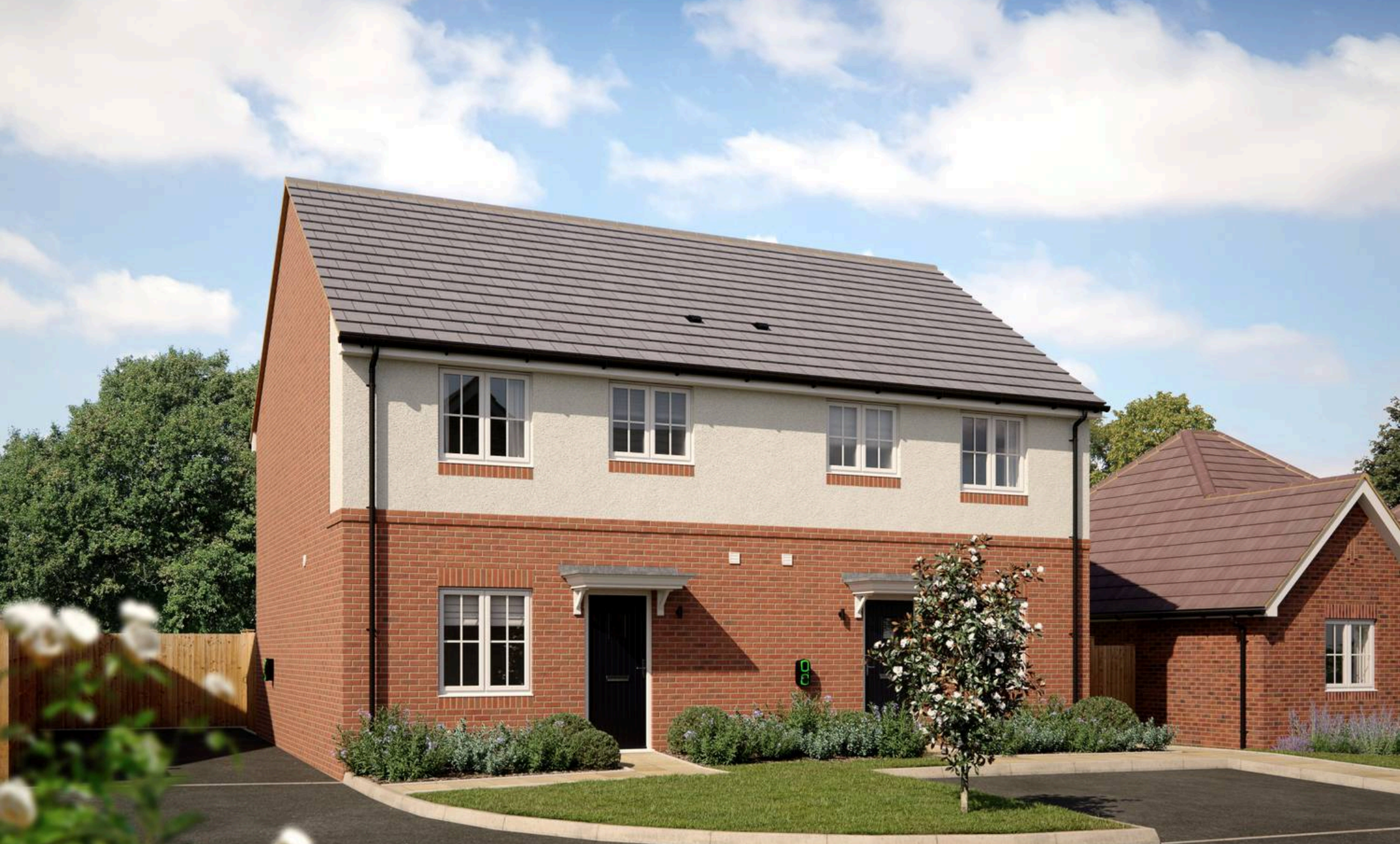
The Bayberry, Restrop Road, Purton Swindon