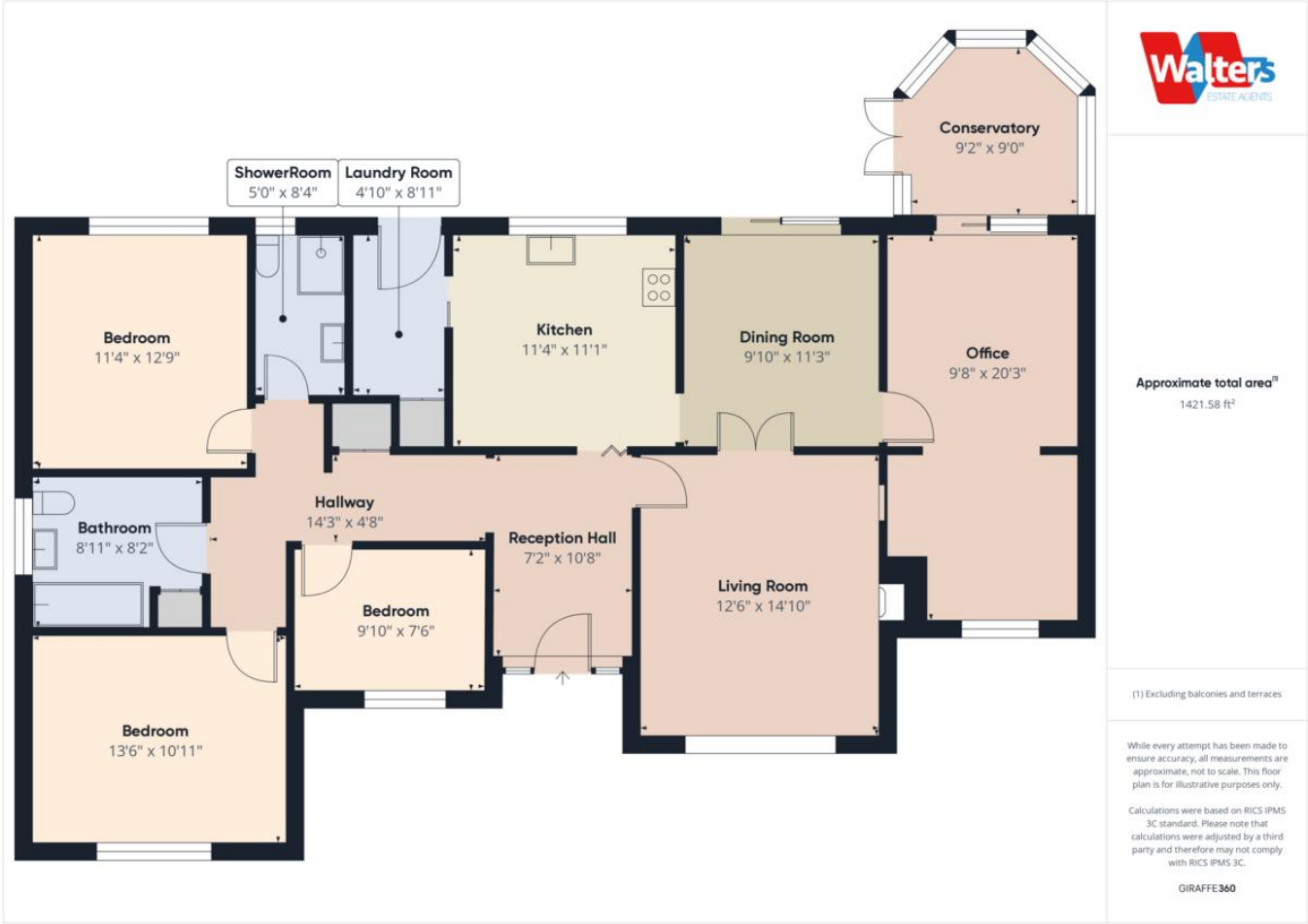
Floor plan is to show layout only and not drawn to scale.

MONEY LAUNDERING REGULATIONS: Under the Money Laundering Rules 2007, The Proceeds of Crime Act 2002 and The Terrorism Act 2000 the Agent is legally obliged to verify the identity of the Client through sight of legally recognised photographic identification (e.g. passport, photographic drivers licence) and documentary proof of address