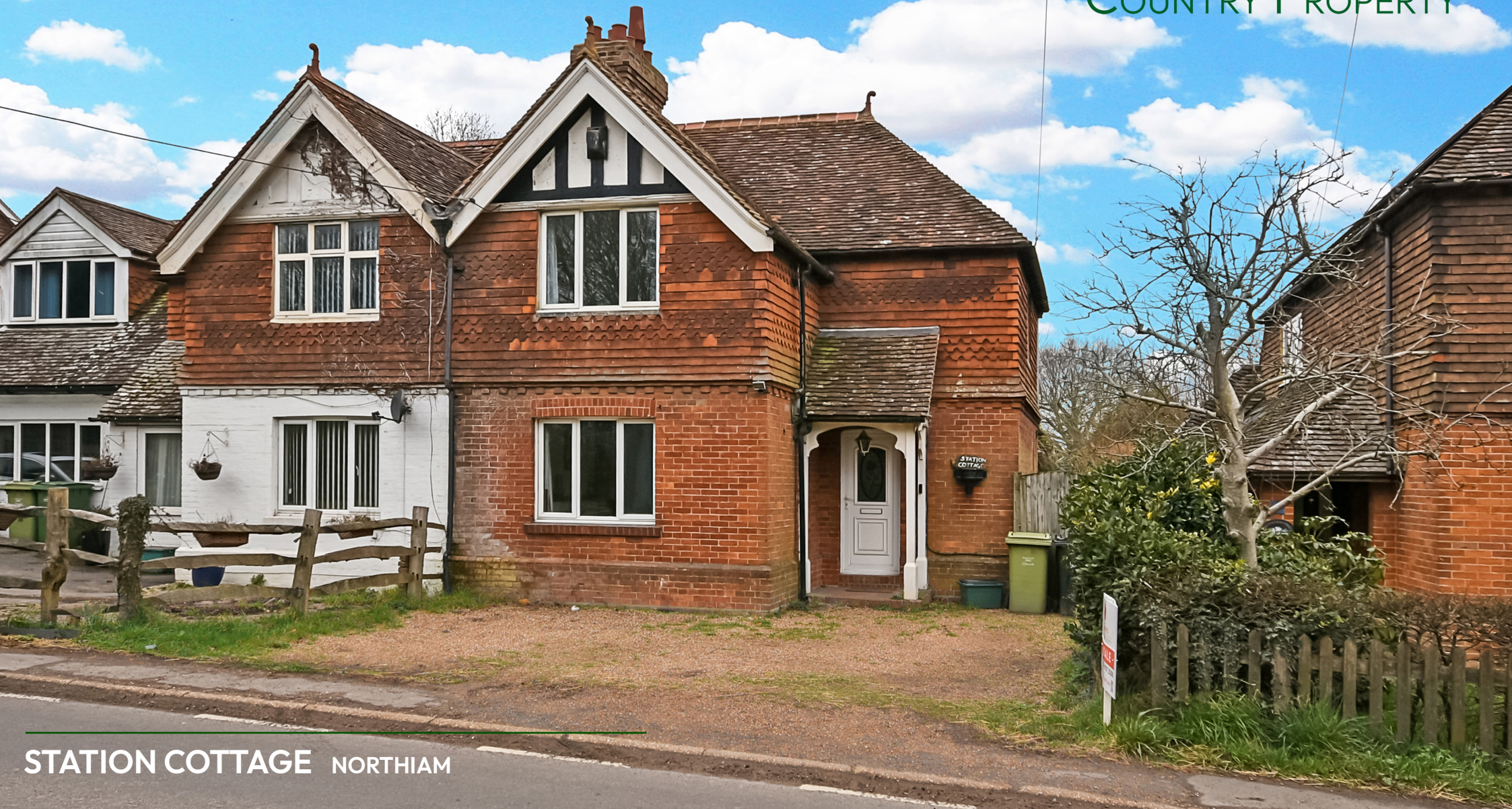
STATION COTTAGE NORTHIAM