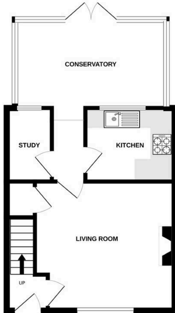
GROUND FLOOR 512 sq.ft. (47.6 sq.m.) approx.