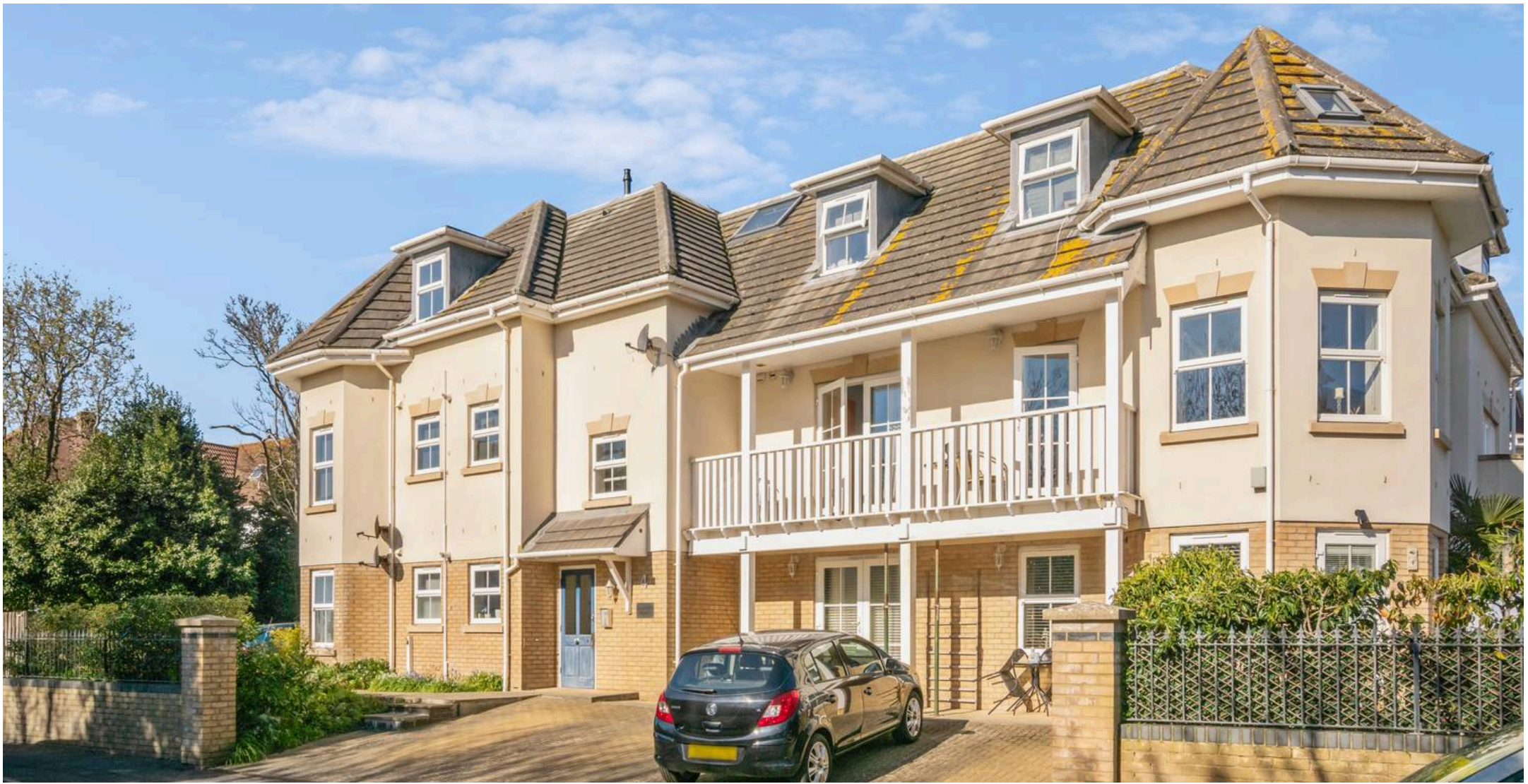
Flat 4, Wollaston Heights, 4 Wollaston Road, Southbourne Bournemouth