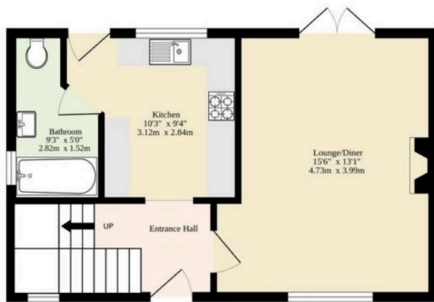
Ground Floor 404 sq.ft. (37.5 sq.m.) approx.