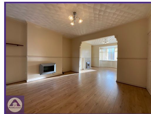
Pen Y Graig Terrace, Brynithel, Abertillery, NP13 2HP