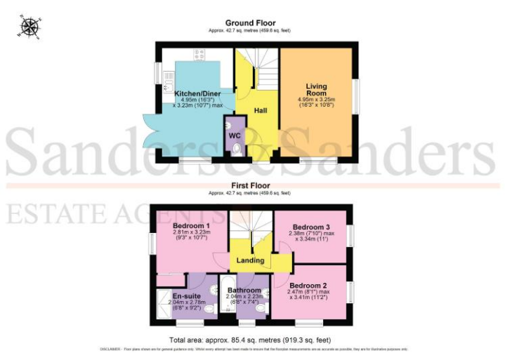
Fixtures & Fittings

These plans are for identification purposes only in relation to where one room is situated to another. They are not to be relied upon in any way for dimensions, scaling or sq. ft/metres. We will not be held responsible for any loss incurred, due to reliance on these measurements from the floor plans or measurements from the property details. You are advised to confirm all measurements.