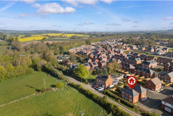
Open-Space Service Charge

Currently 146.33 per annum (this may be subject to change).