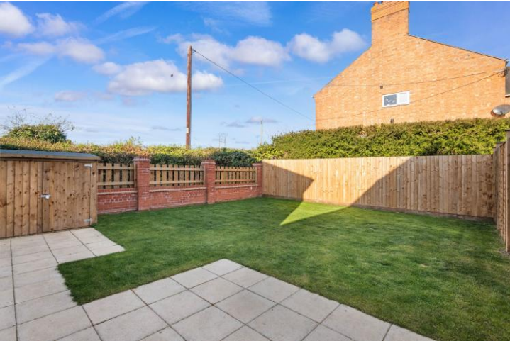
Views to side & Front