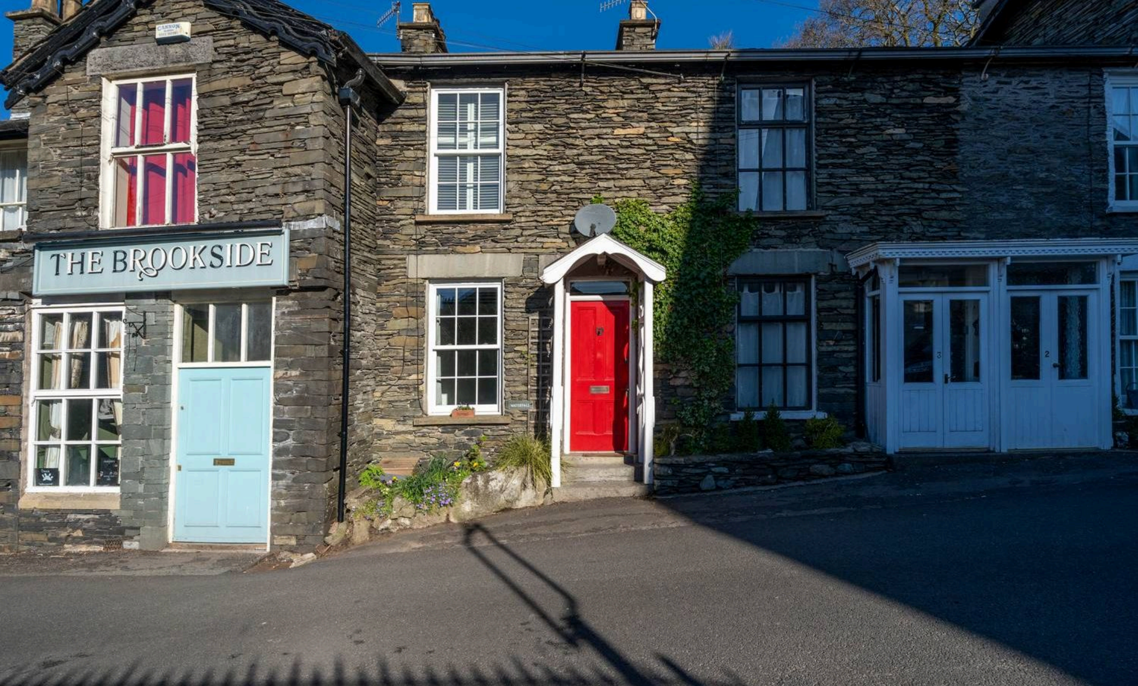
4 Brookside, Lake Road, Windermere £265,000