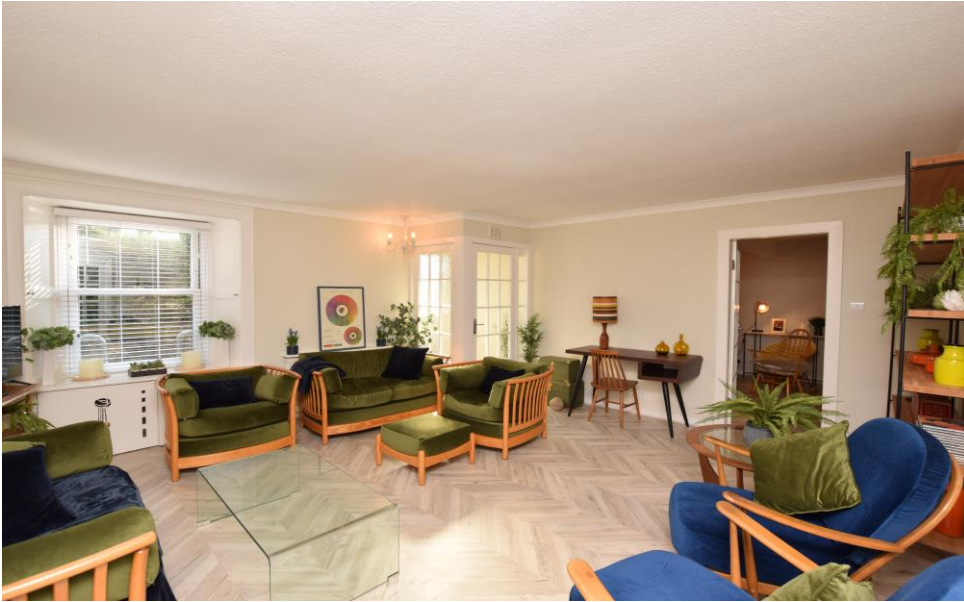
Garden Flat, 1 King's Place, Perth, PH2 8AA Fixed Price - £130,000

Beautifully presented one bed, self-contained garden flat situated on the outskirts of Perth City Centre overlooking the South Inch. Only a short walk of both bus and train station. Gas central heating and double glazing throughout. Shared courtyard to the rear of the property and ample on street parking. Viewing highly recommended to appreciate this lovely spacious property.