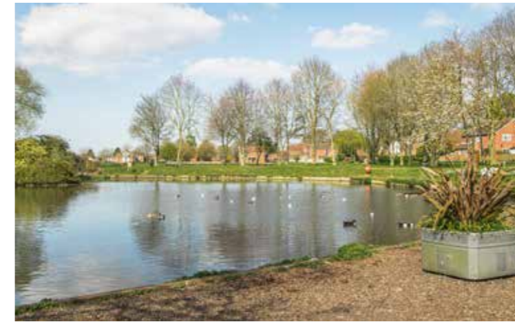
South Wootton village pond

“How lucky we were to have such freedom in the countryside and a great local community in which to grow up.”