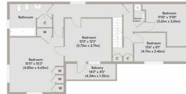
First Floor Approximate Floor Area 889 sq. ft (82.54 sq. m)