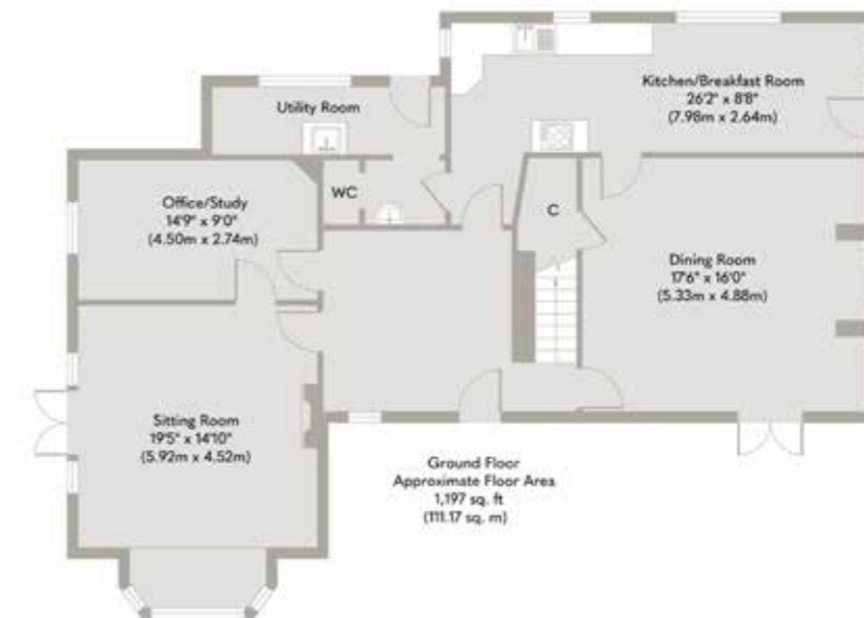
Ground Floor Approximate Floor Area 1,197 sq. ft (111.17 sq. m)

Whilst every attempt has been made to ensure the accuracy of the floor plan contained here, measurements of doors, windows, rooms and any other items are approximate and no responsibility is taken for any error, omission, or mis-statement. This plan is for illustrative purposes only and should be used as such by any prospective purchaser or tenant. The services, systems and appliances shown have not been tested and no guarantee as to their operability or efficiency can be given.