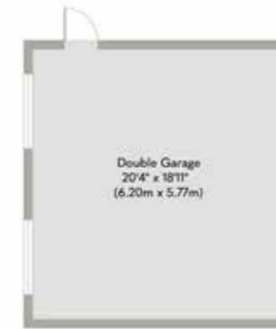
Garage Approximate Floor Area 385 sq. ft (35.73 sq. m)