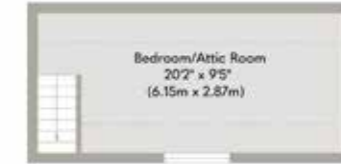
Second Floor Approximate Floor Area 193 sq. ft (17.95 sq. m)