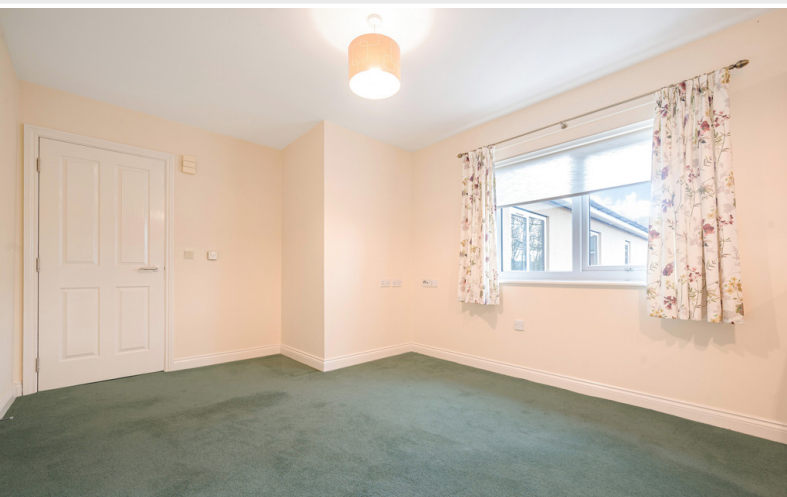
Open Plan Dining/ Living Room