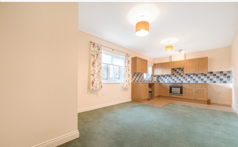
Open Plan Dining/ Living Room