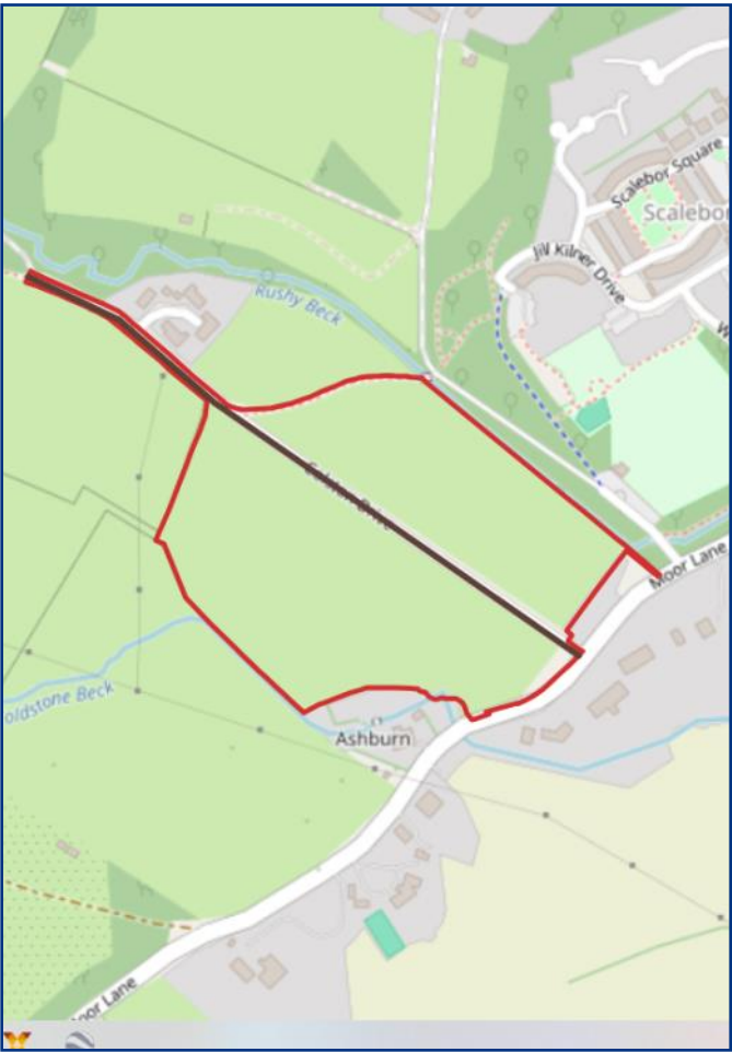
Not to scale—for identification purposes only