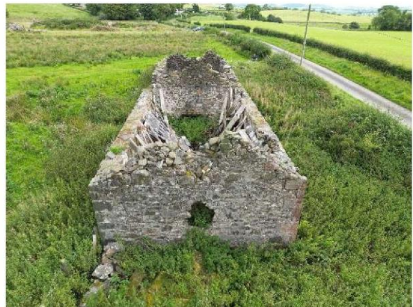
Cottages seen looking towards Meikle Beoch