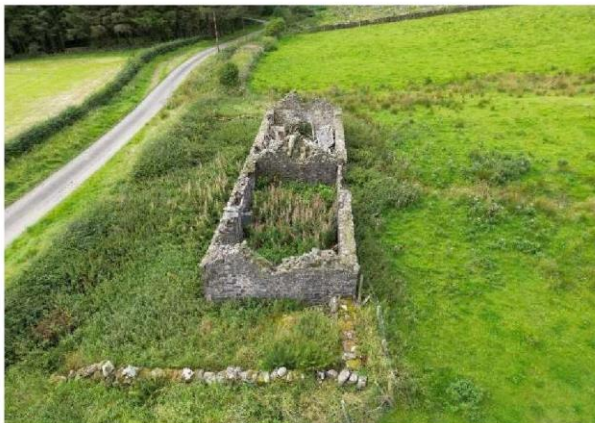
Cottages seen from East, looking SW

The planning application and plans were prepared by Marc Henkelmann who can be contacted on 01557 500505 for further information.