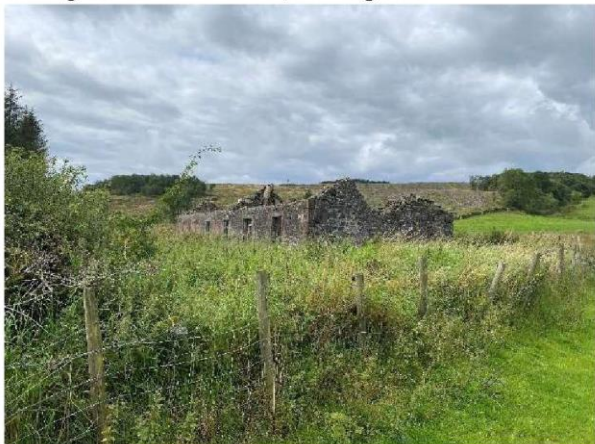
View of cottages from access gate