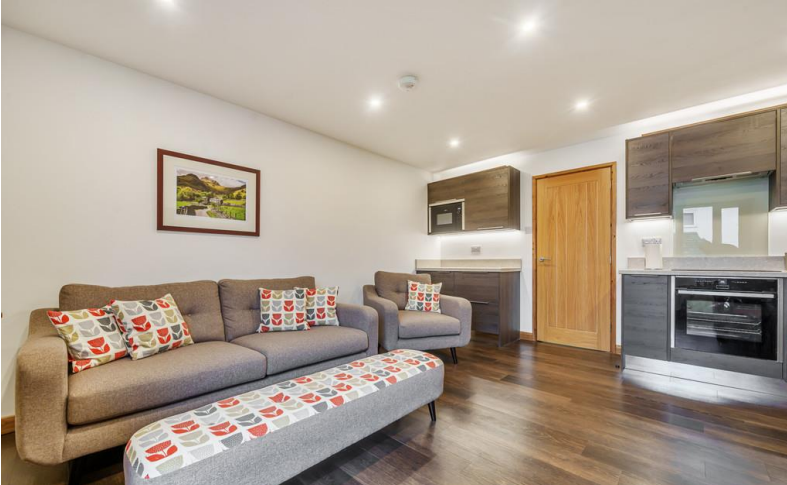
Living Room And Kitchen Area