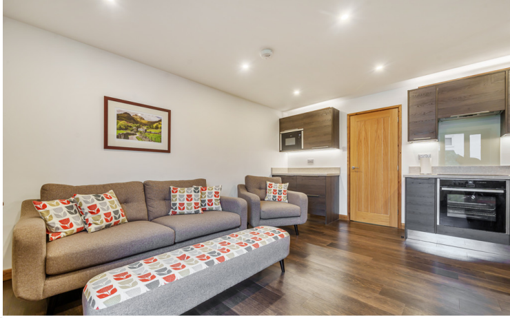
Living Room And Kitchen Area