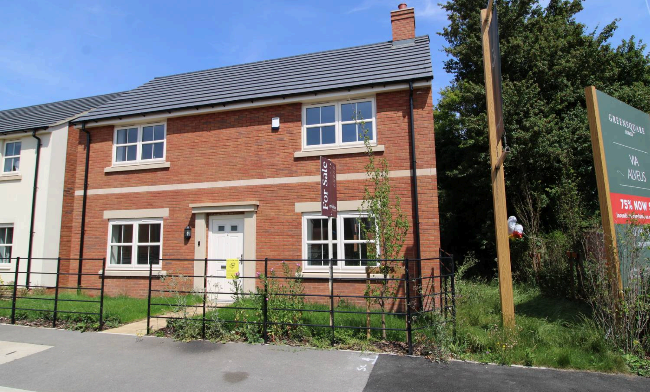
The Woodcote, Farrier Street, Blunsdon Swindon