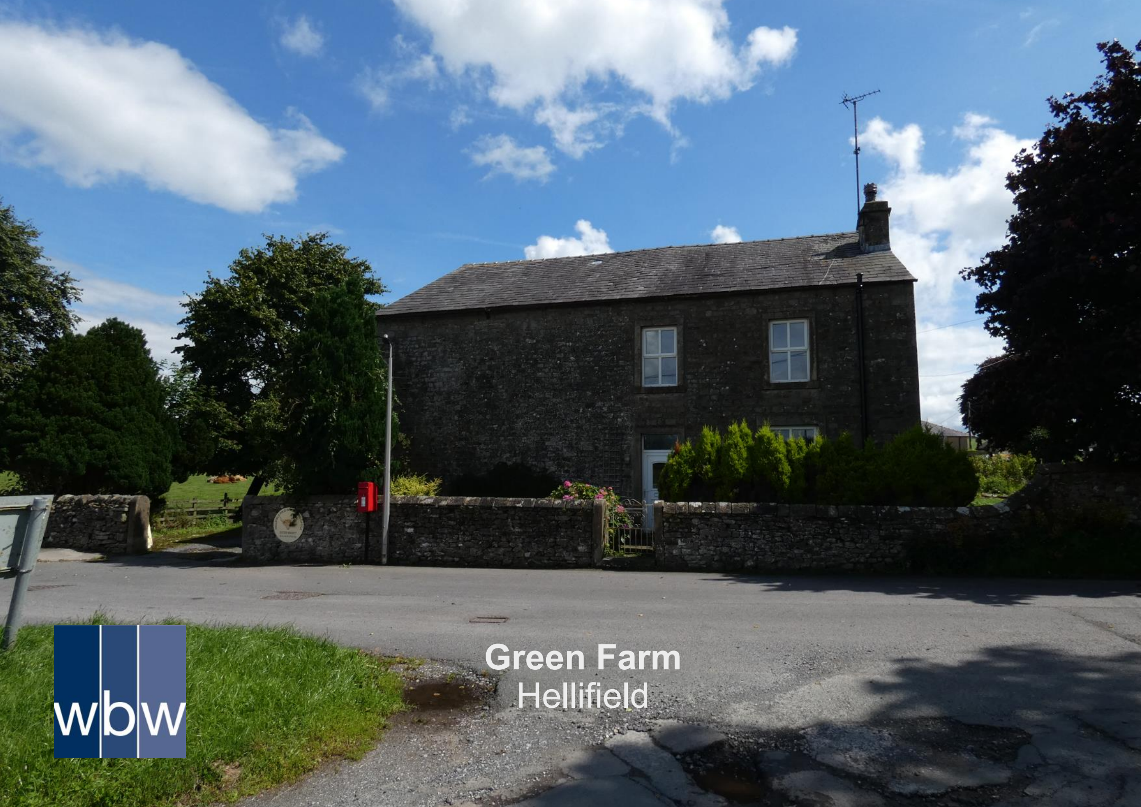
Green Farm Hellifield