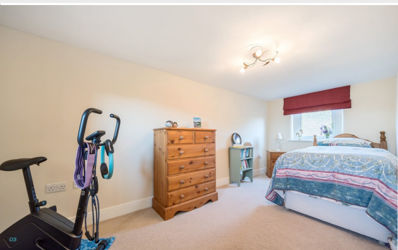
Office/ Bedroom Five

Living Room 13' 11" x 12' 0" (4.24m x 3.66m)