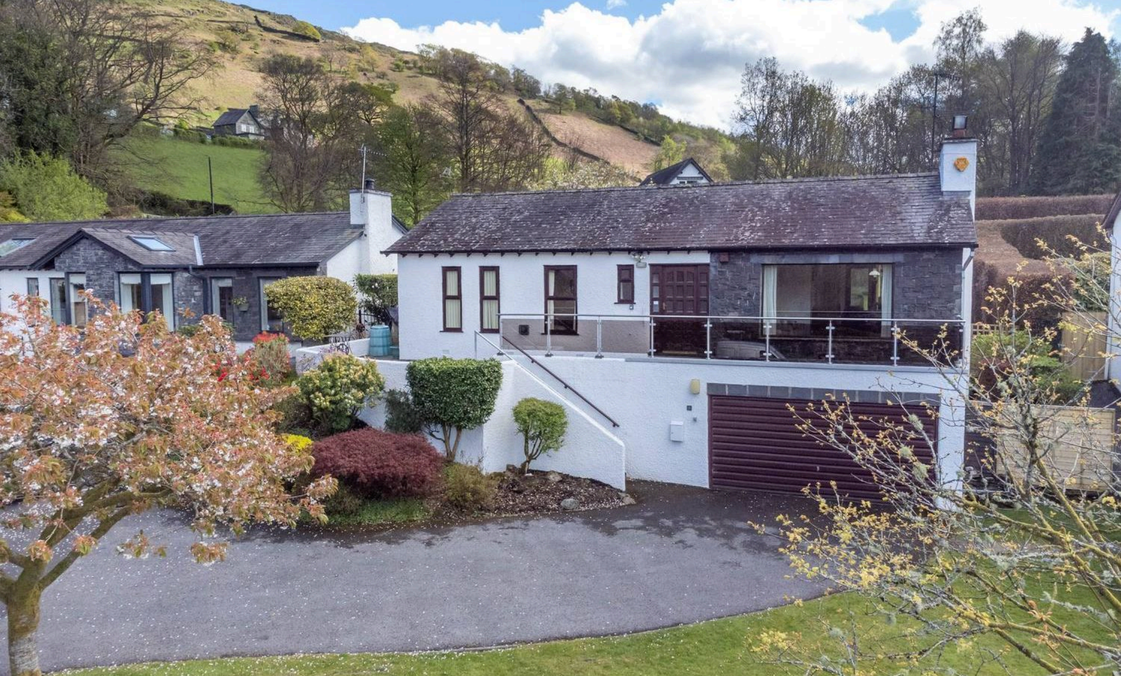
2 Ghyllside Stockghyll Lane, Ambleside £745,000