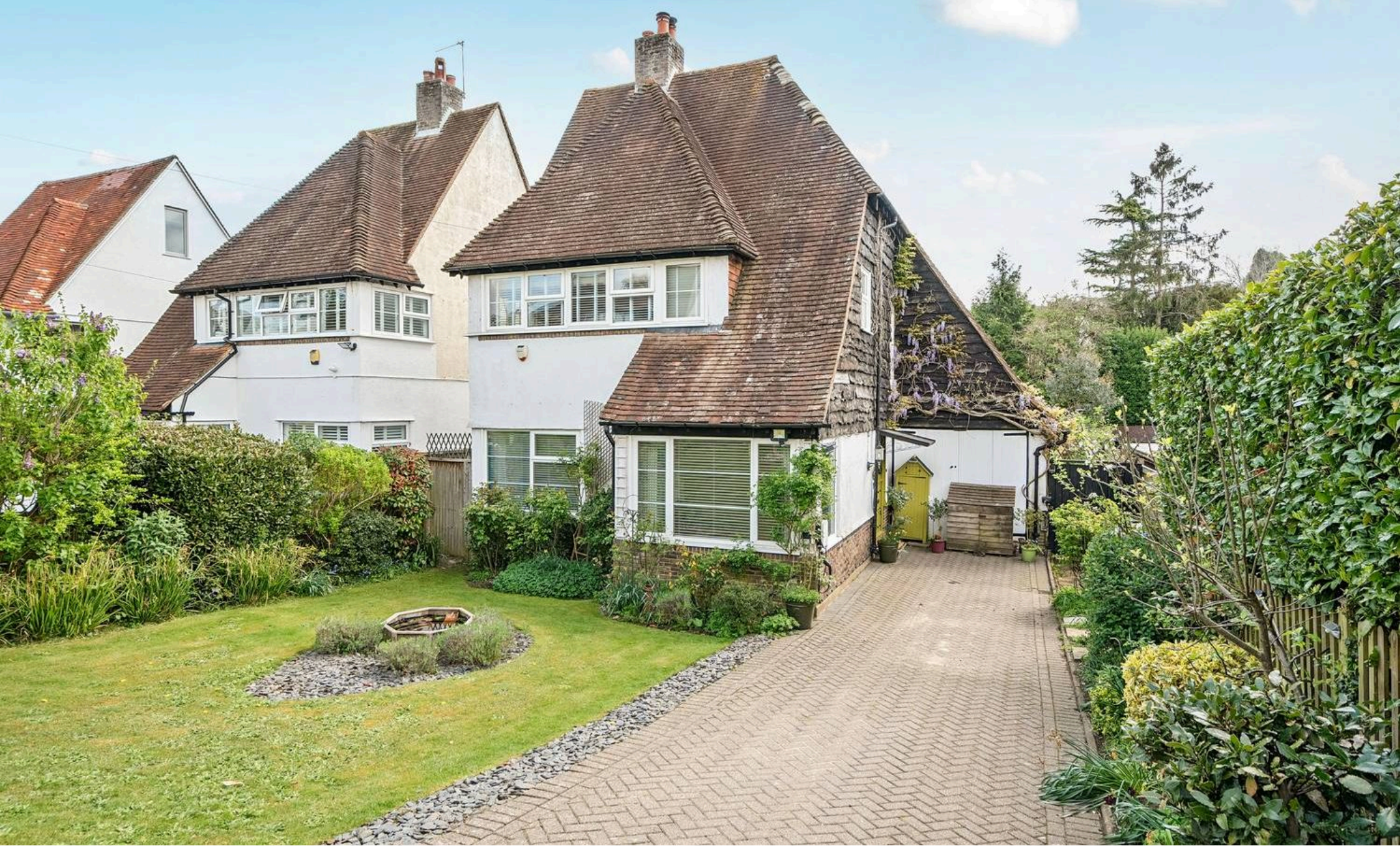
23 The Netherlands, Coulsdon – CR5 1NJ £675,000