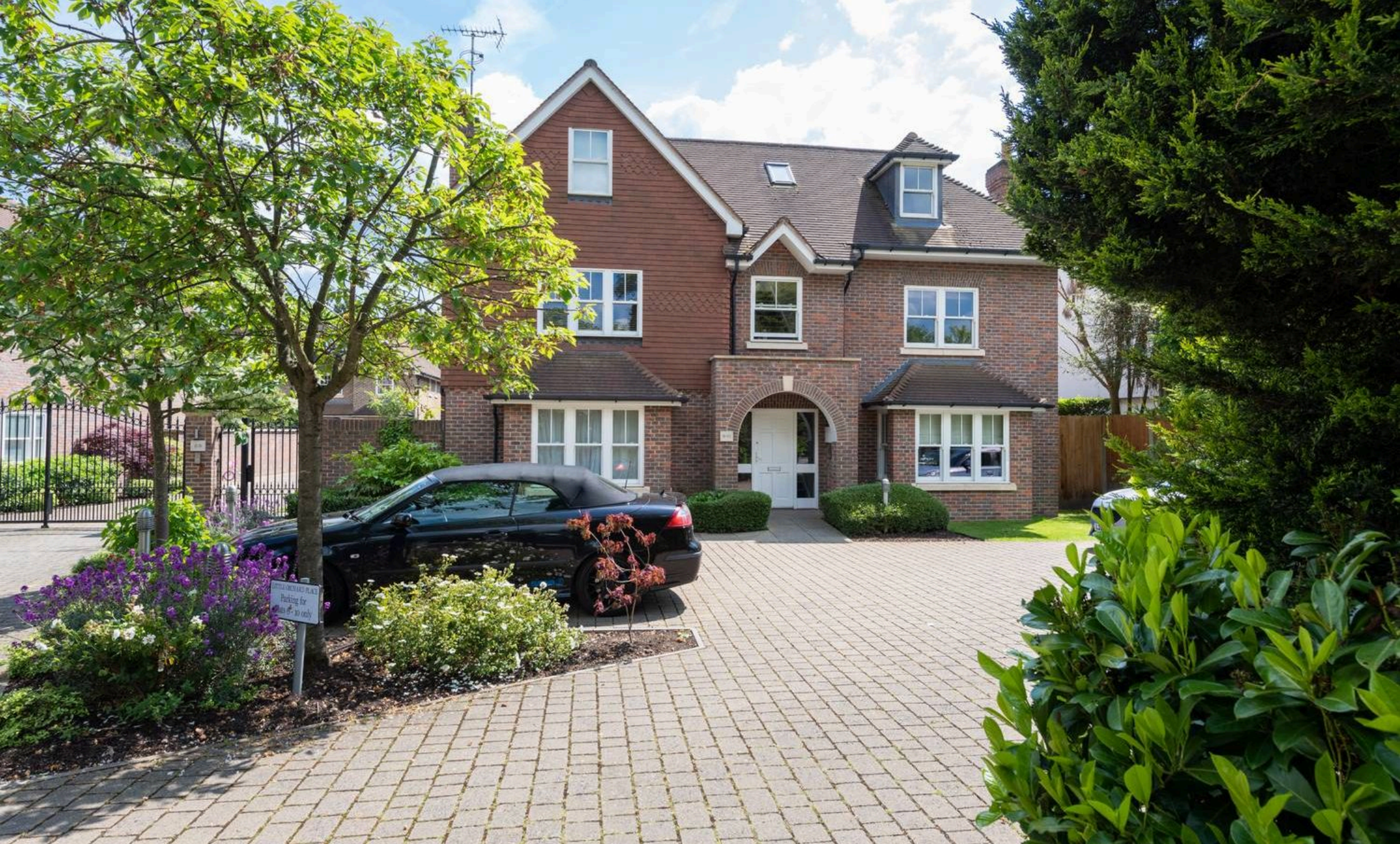
Flat 10 Little Orchard Place, Esher £2,200 pcm