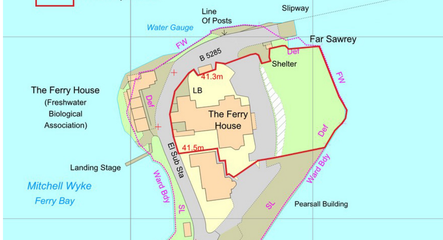
Ordnance Survey Map Ref -095400