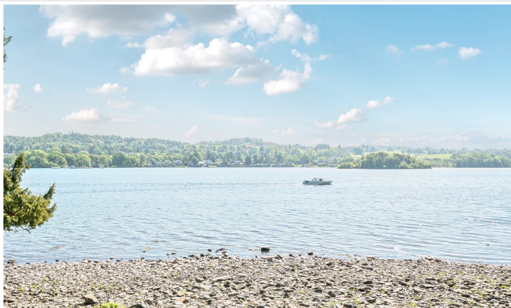
Shared Lake Frontage