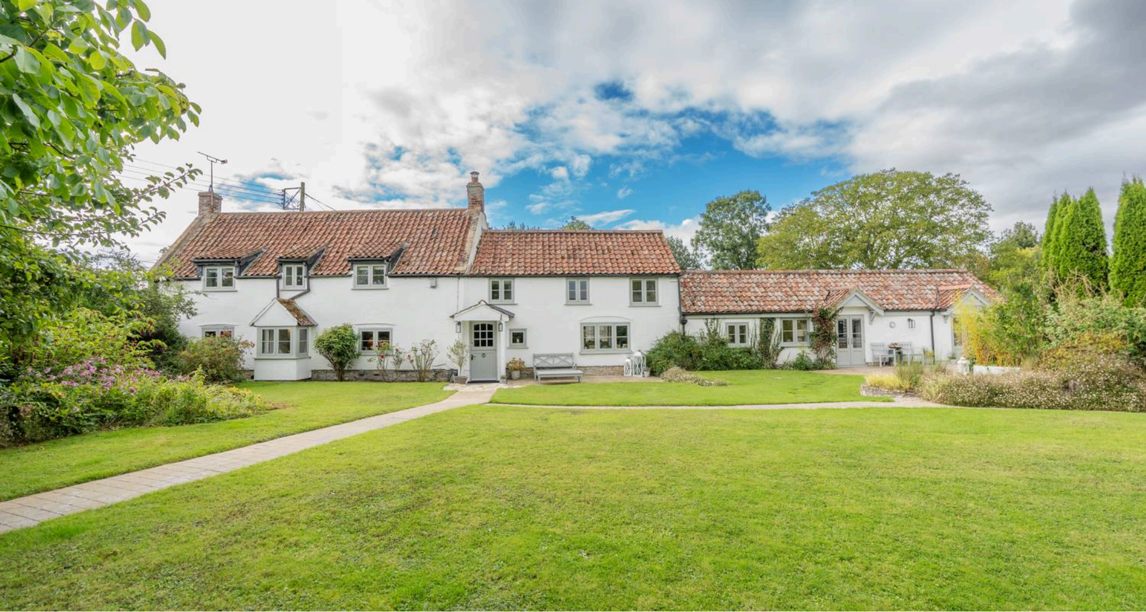
Walnut Farm The Causeway, Mark Highbridge