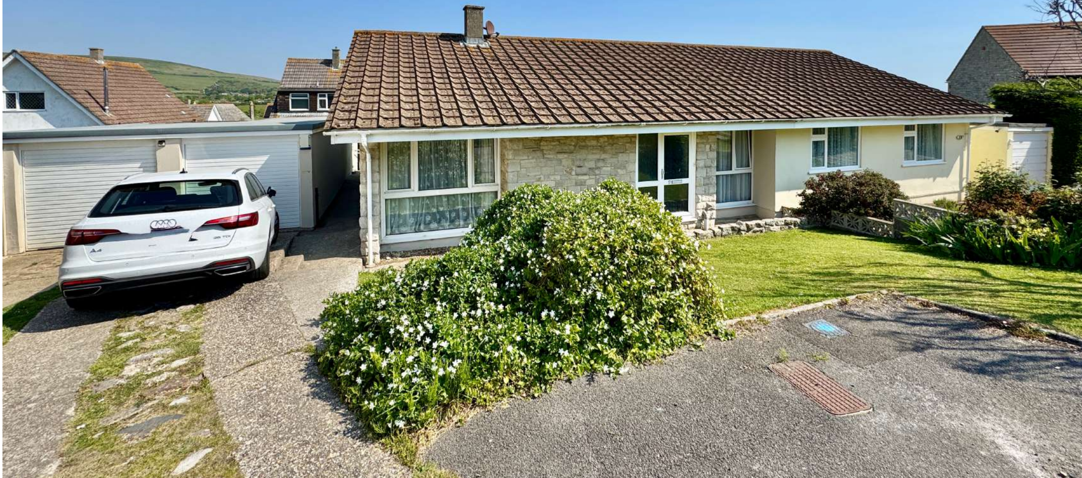
17 ALDERBURY CLOSE, SWANAGE £375,000 Freehold