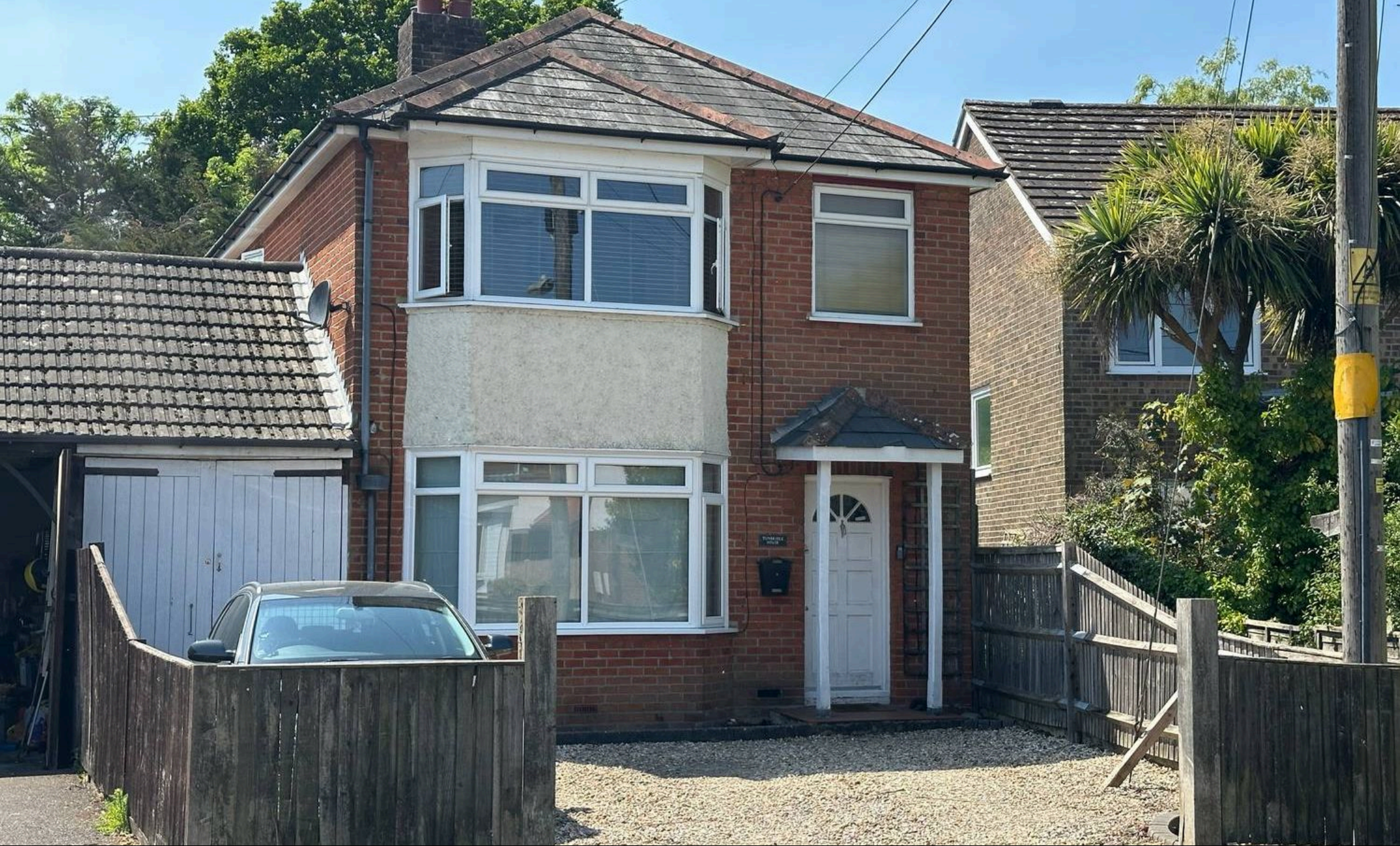
Tunbridge House Hythe Road, Marchwood, SO40 4WT £450,000