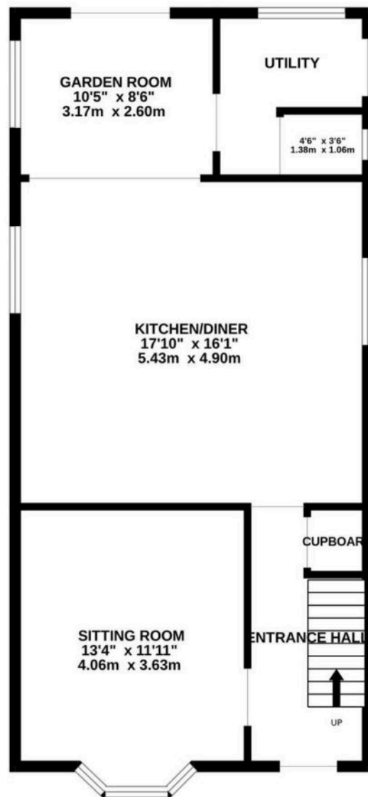
GROUND FLOOR 714 sq.ft. (66.4 sq.m.) approx.