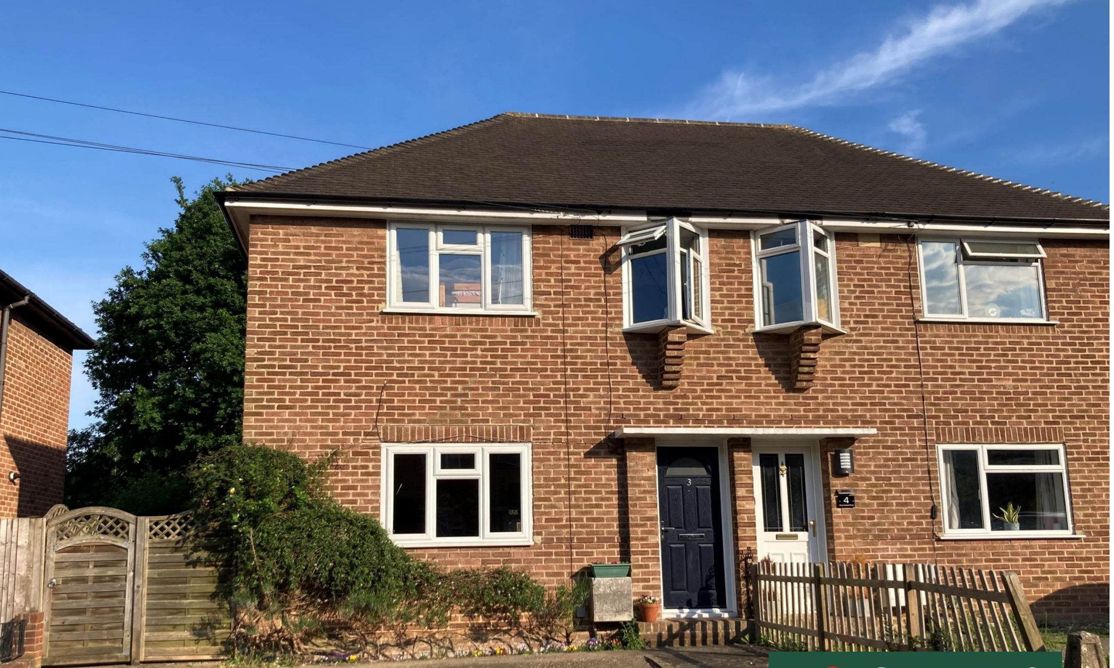
3, Groomsland Drive | Billingshurst | West Sussex | RH14 9HA