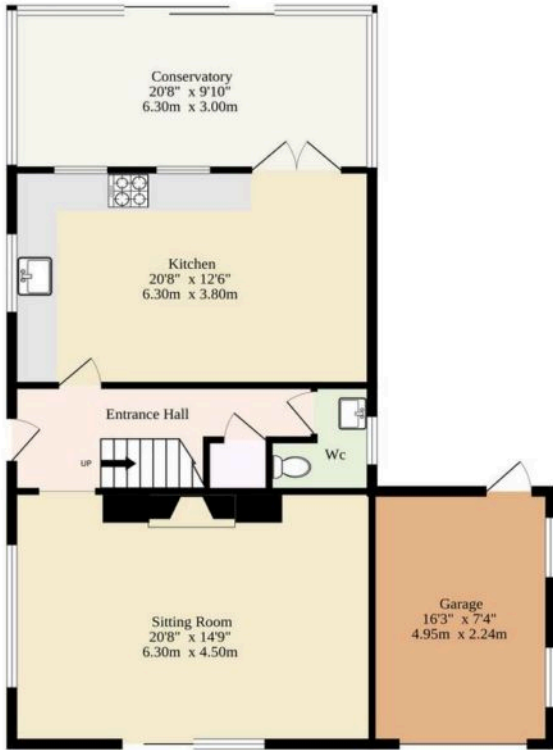
Ground Floor 1817 sq.ft. (164.5 sq.m.) approx.