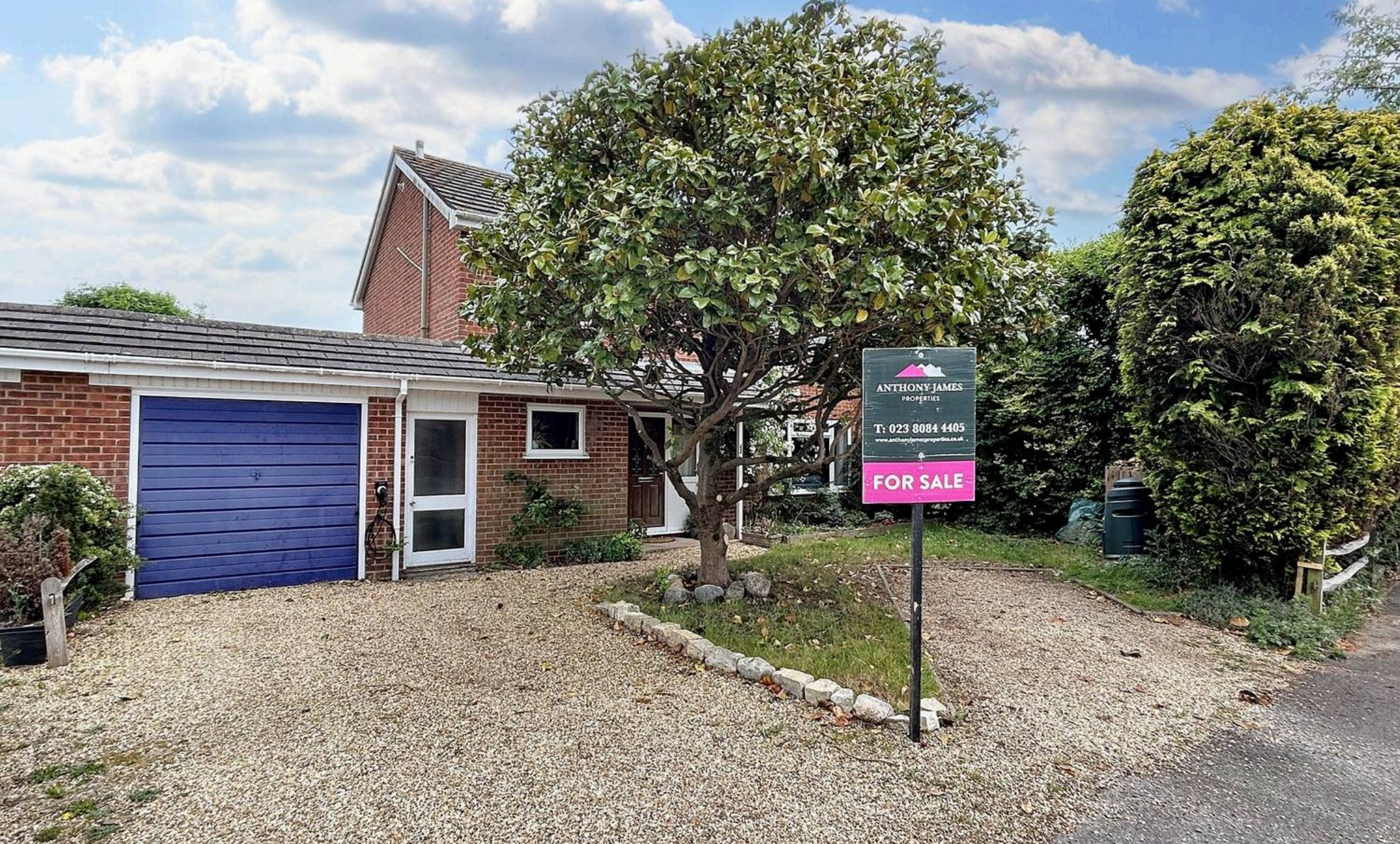
1 Foxhayes Lane, Langley £439,950