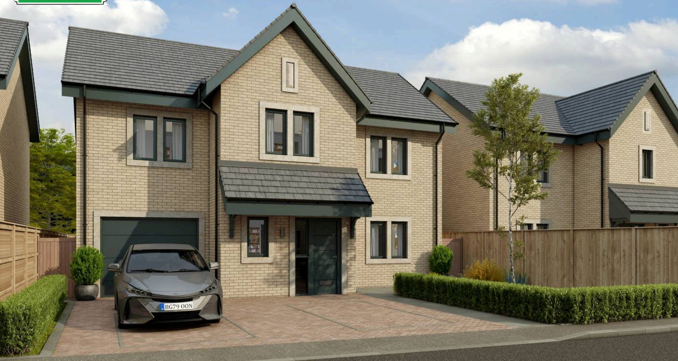
Plot 14, The Birch, Barley View, Roughbirchworth Lane, Oxspring Sheffield