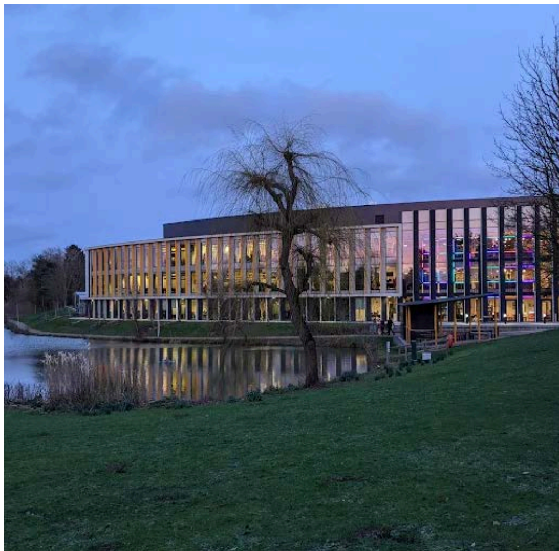
CAMBRIDGE SCIENCE PARK