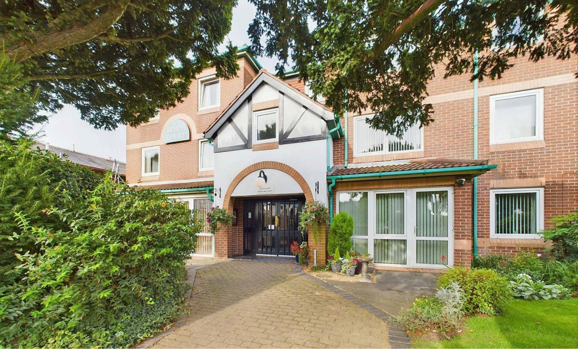
42 Beech Court, Mapperley – NG3 5PZ £100,000