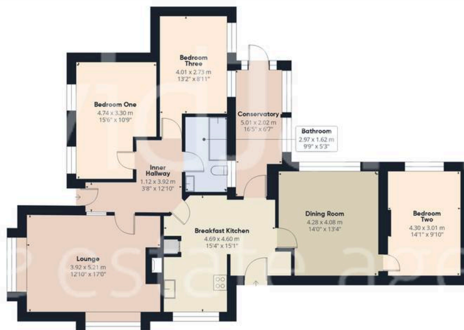
Floor 0 Building 1