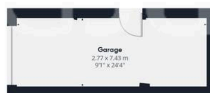
Floor 0 Building 2