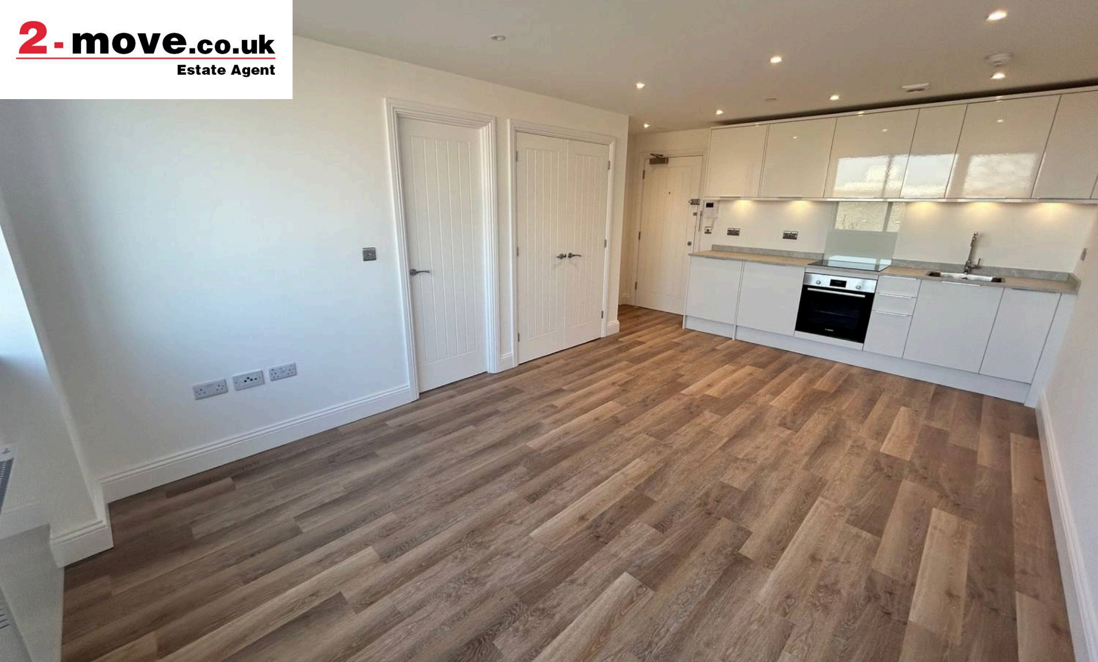
Flat 50, Trinity Point New Road, Gravesend Gravesend