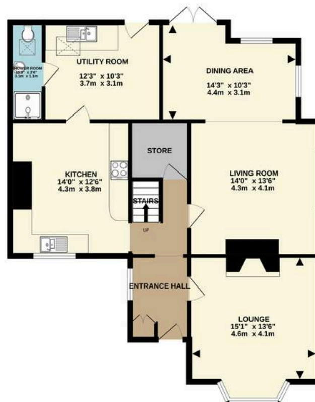
GROUND FLOOR 956 sq.ft. (88.8 sq.m.) approx.