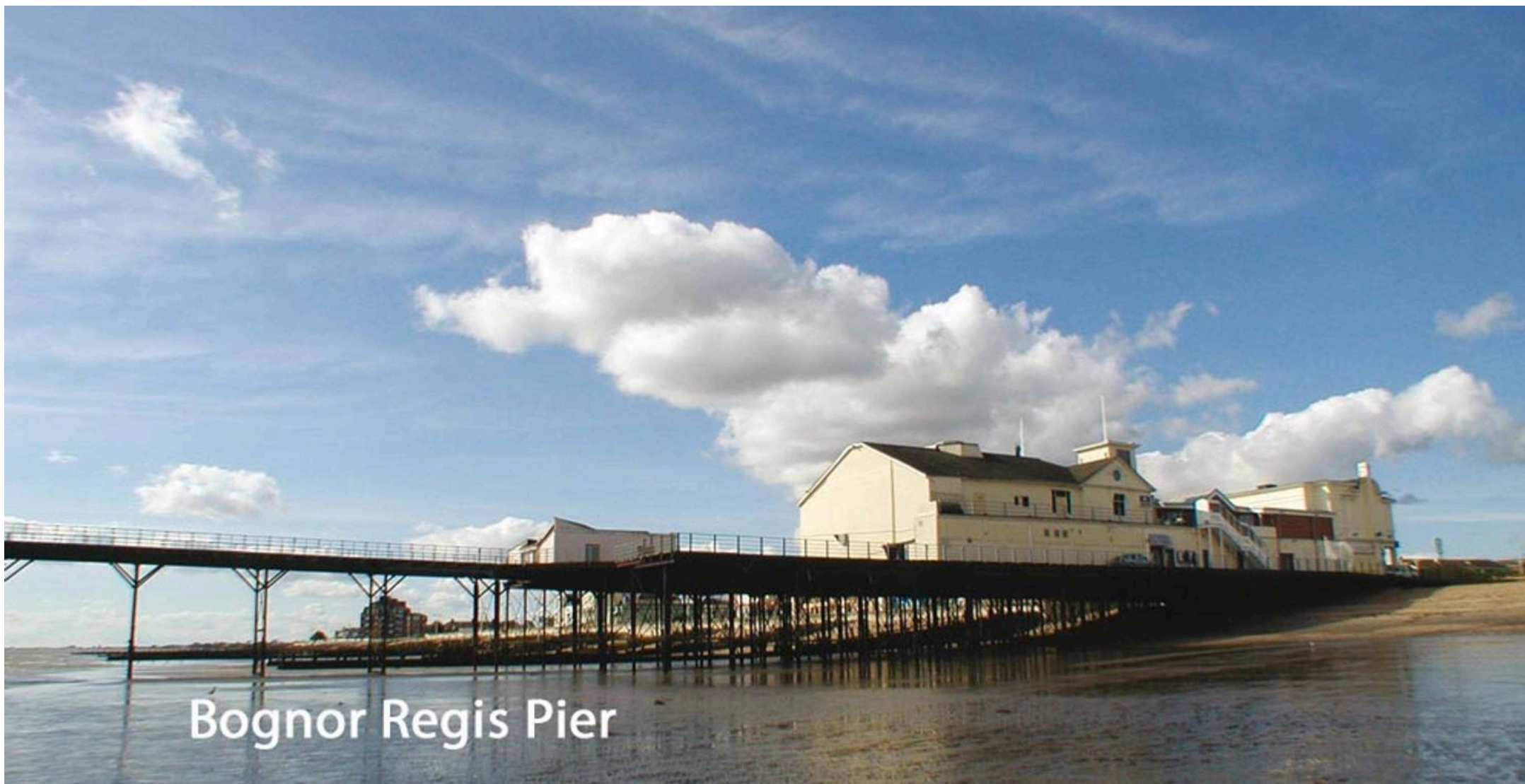
Bognor Regis Pier