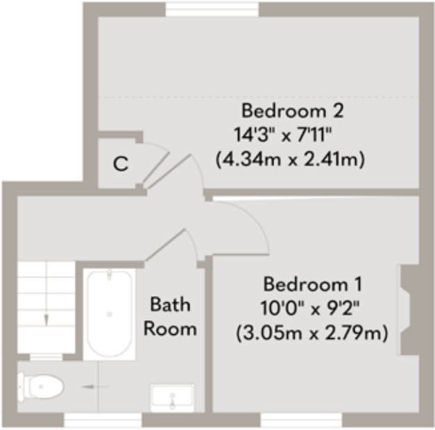
First Floor Approximate Floor Area 296 sq. ft (27.49 sq. m)