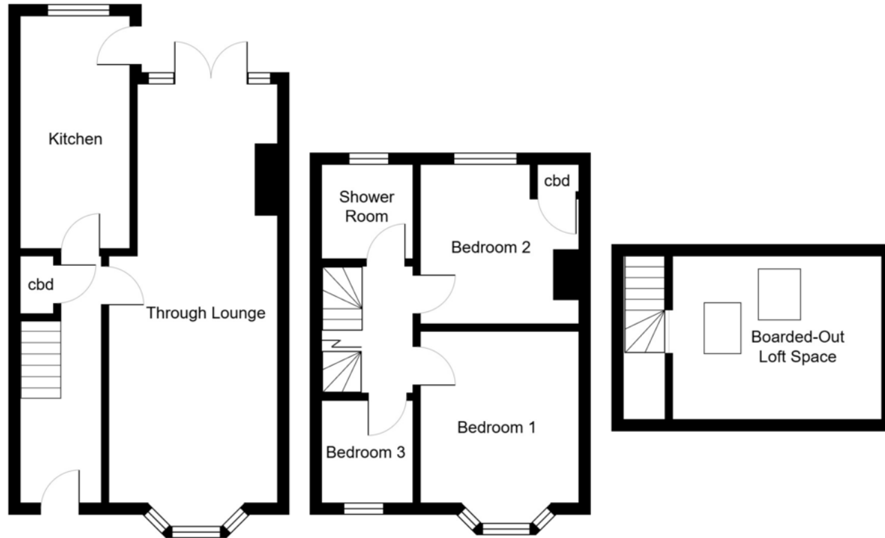
DRAFT FLOOR PLAN - AWAITING VENDOR'S APPROVAL

All measurements are approximate and for display purposes only