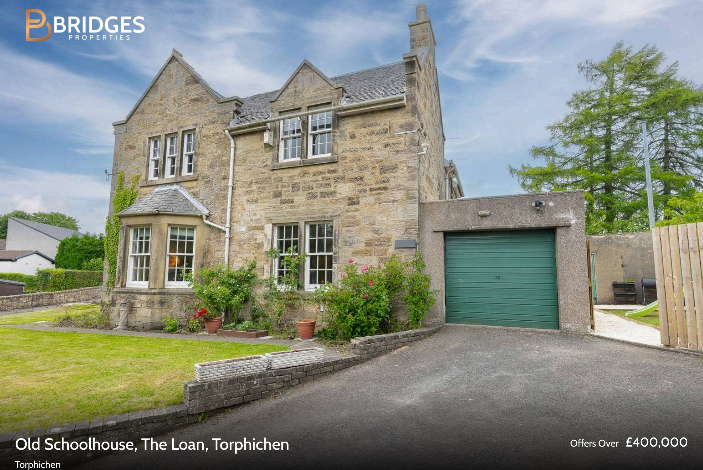
Old Schoolhouse, The Loan, Torphichen