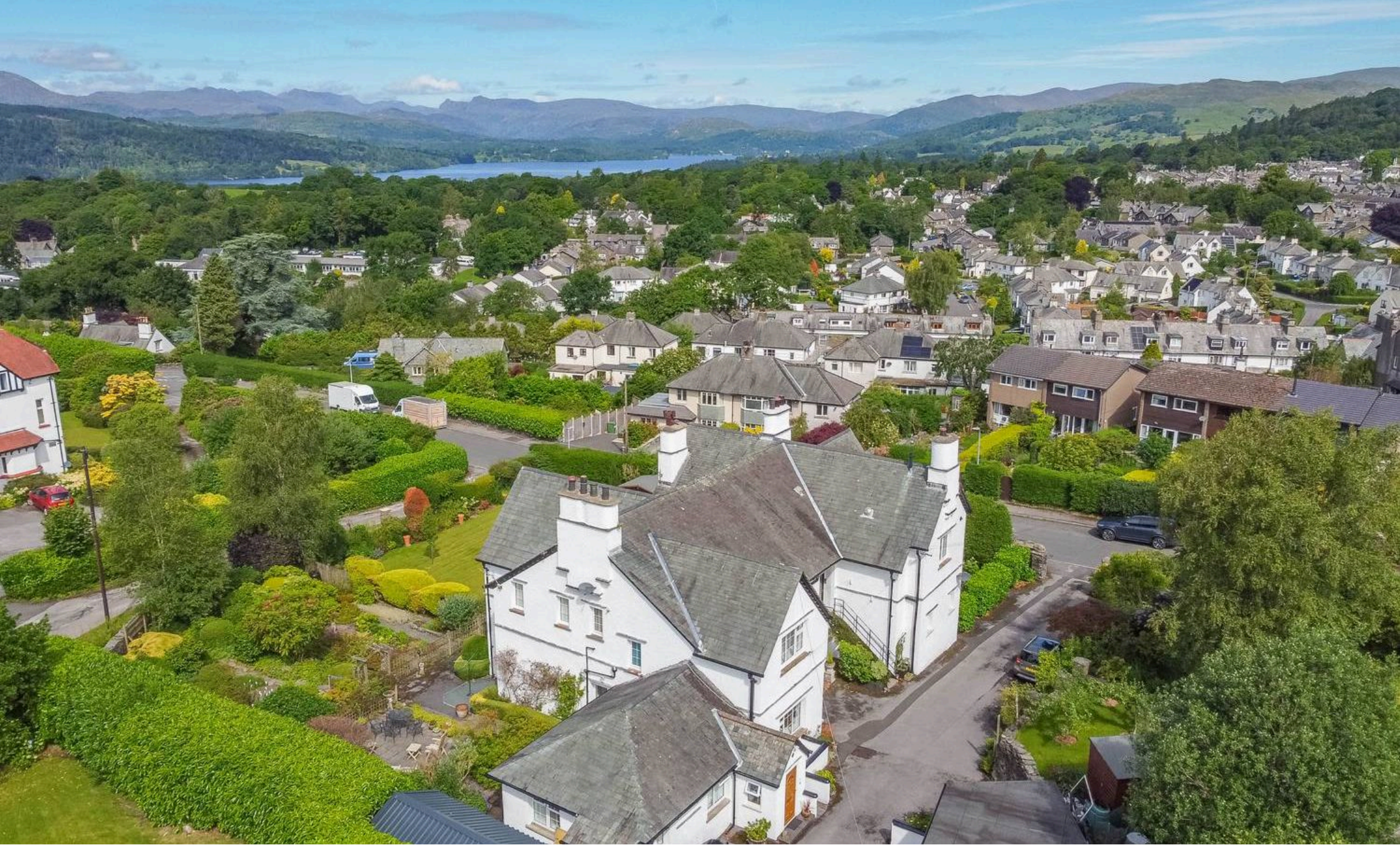
2 Lynstead Thornbarrow Road, Windermere £315,000