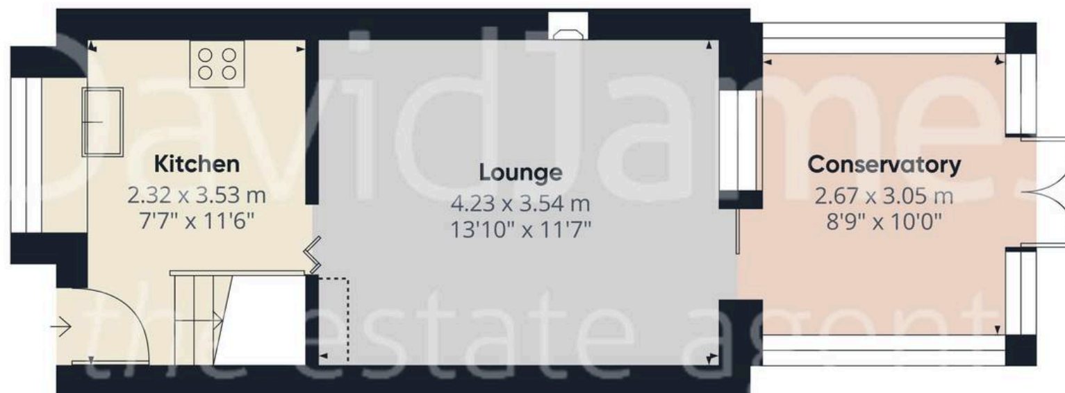
Floor 0 Building 1