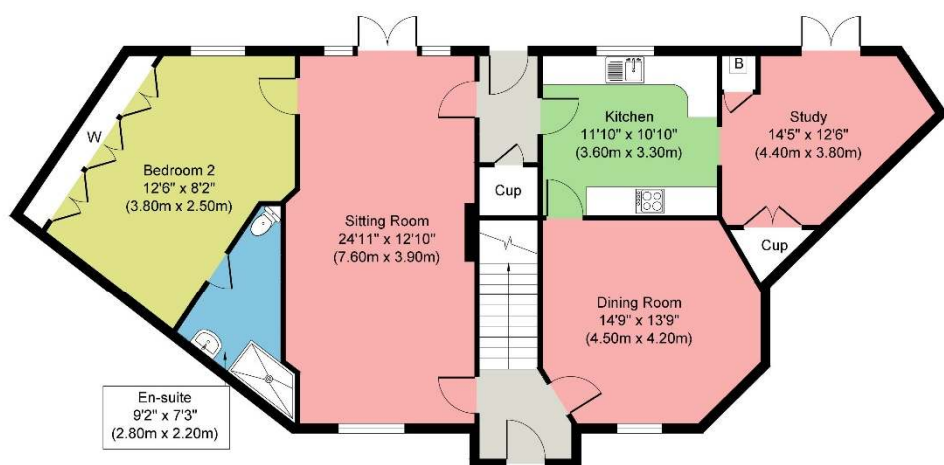
Ground Floor Approximate Floor Area 1190 sq. ft (110.56 sq. m)