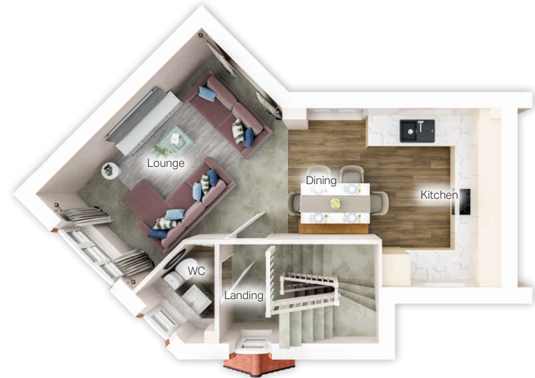
Upper Ground Floor