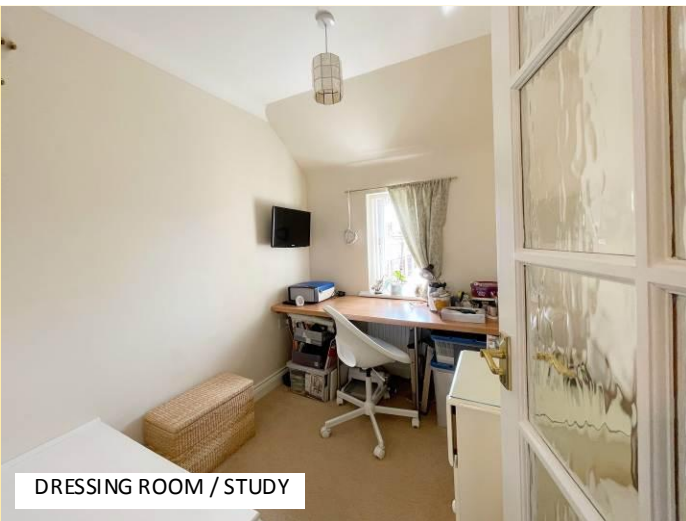
DRESSING ROOM / STUDY