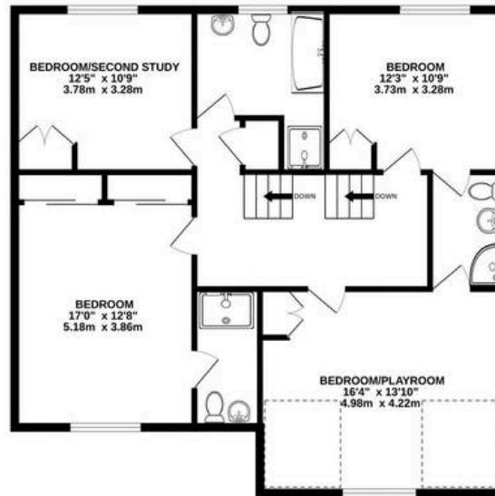
1ST FLOOR 1051 sq.ft. (97.6 sq.m.) approx.