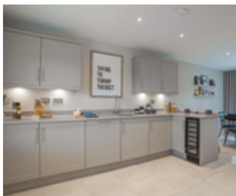
Each home at The Oaks has been designed to maximise light and space.