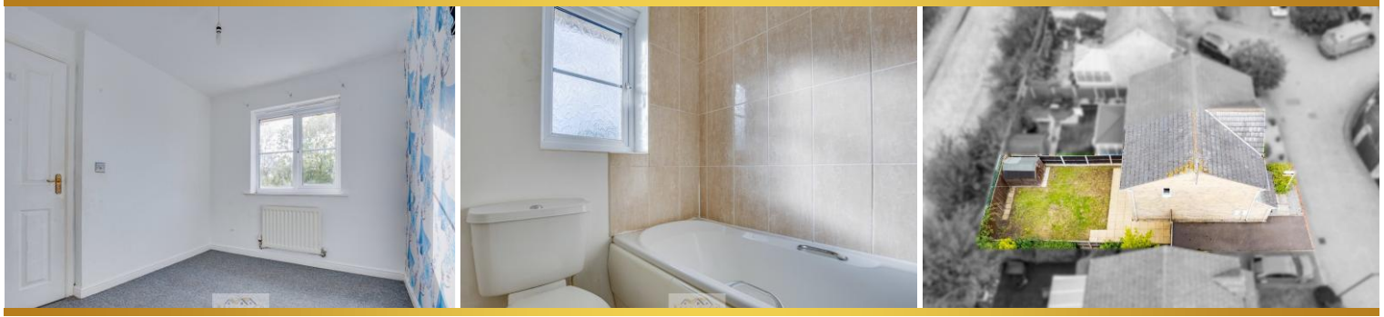
GROUND FLOOR 414 sq.ft. (38.4 sq.m.) approx.